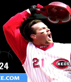
Sean Casey "The Mayor" Cincinnati Reds Hall of Famer 3x MLB All Star